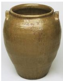
Dave Drake Stoneware Vessel