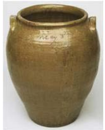
David Drake Stoneware vessel

These presentations and discussions will focus on heritage, histories, and pottery production that flourished in the Edgefield District in the 19th Century. Our discussions will address the challenges to understanding the complex social situations which enslaved and later freed African Americans found themselves in the Edgefield District. Our speakers will inspire the broad public audiences to consider how enslaved Africans learned the pottery trade while in bondage and later used this knowledge as a marketable skill after emancipation. The public audience will be presented this rich history through the multiple disciplines of Art History, Archaeology, History, and Ethnographic analogy.